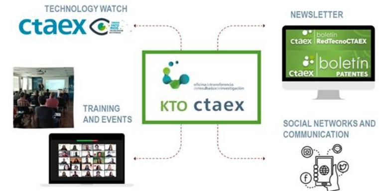
Figure 7.- Knowledge Transfer Office (KTO) services

The use of ICTs and digitalisation processes are the real drivers of development in agriculture and the food industry. The demonstration of 4.0 processes is one of the pillars of the centre, through the implementation of " farm-food-labs ".