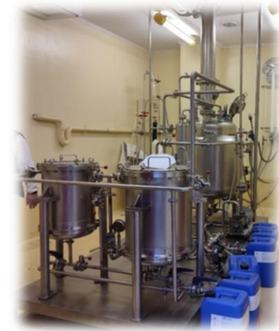
Figure 4.- S-L extraction pilot plant

The Analytical department carries out analysis for the agri-food sector of the area. Apart from the external companies' agri-food matrices analysis, this Dept. addresses R&D lines related to the extraction, isolation and stabilization of chemical interesting compounds found in agricultural and food residues and by-products. This department is highly specialized in agri-food kind of matrixes. The Laboratory is accredited by ENAC in the UNE-EN ISO/IEC 17025:2017 standard with accreditation number 1467/LE2629 for medicinal cannabis and industrial hemp testing.