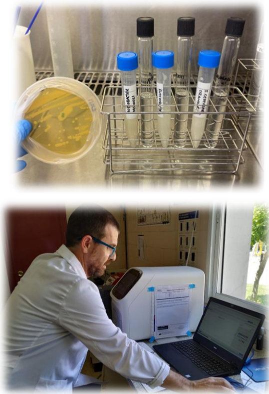
Figure 7.- CTAEX's Biotechnology department

In addition, the Biotechnology area provides expertise in the assessment of soil-plant-microbiome interactions, supporting data-driven monitoring and the evaluation of biological solutions under different environmental and management scenarios.