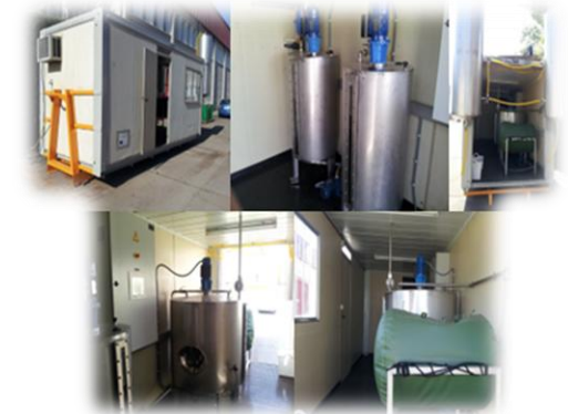
Figure 5.- Biomethanization pilot plant