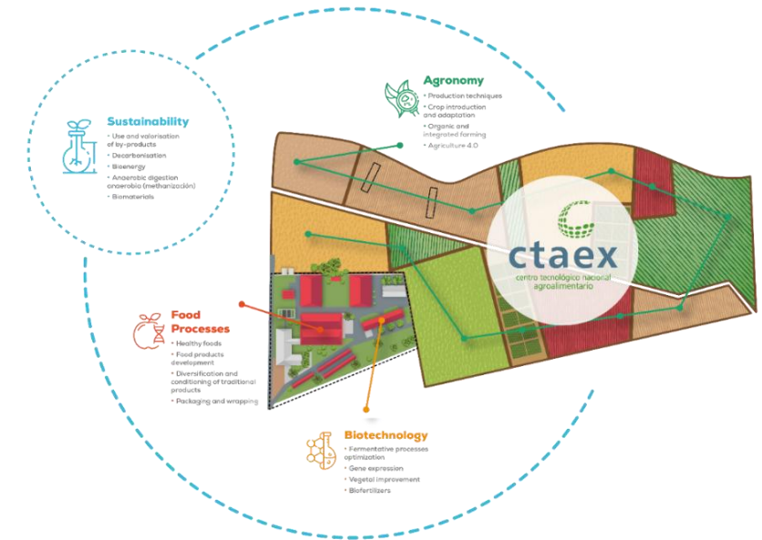
Figure 2.- CTAEX's areas

CTAEX's Agricultural Area supports sustainable and biodiversity-friendly agriculture through its extensive experimental infrastructure, which includes greenhouses and 23 hectares of experimental farms (4 hectares of which are ECO-certified) equipped for pot trials and large-scale cultivation with optimized irrigation systems. This capacity, together with regional authorization to work with GMOs and its official status as a registered producer of seeds and greenhouse plants, enables the testing and validation of environmentally friendly practices such as reduced use of plant-protection products, optimized fertilization and irrigation, improved soil management, and the evaluation of stress-tolerant crop varieties.